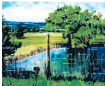
Seneca Lake Vista, Oil on canvas, 2001

You provide the Cornell or Ithaca photo and we provide an original oil painting! A unique gift, for yourself or others. Drawings, prints, and notecards also available.