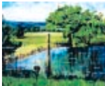
Seneca Lake Vista. Oil on canvas, 2001

You provide the Cornell or Ithaca photo and we provide an original oil painting! A unique gift, for yourself or others. Drawings, prints, and notecards also available.