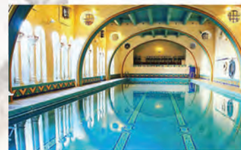
Berkeley City Club