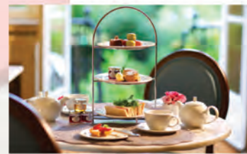
Royal Overseas League