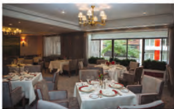
The Cornell Club - New York